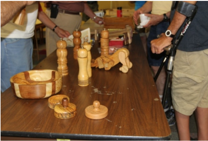
Top Left: Salt and Pepper mills, jar lids, bowl & Push Toy by Dale Barglof