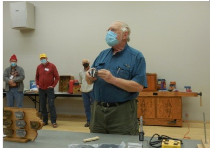
Top Right: Modified Dowling Jig to do both Edge and Surface Dowling by Jim Wikle