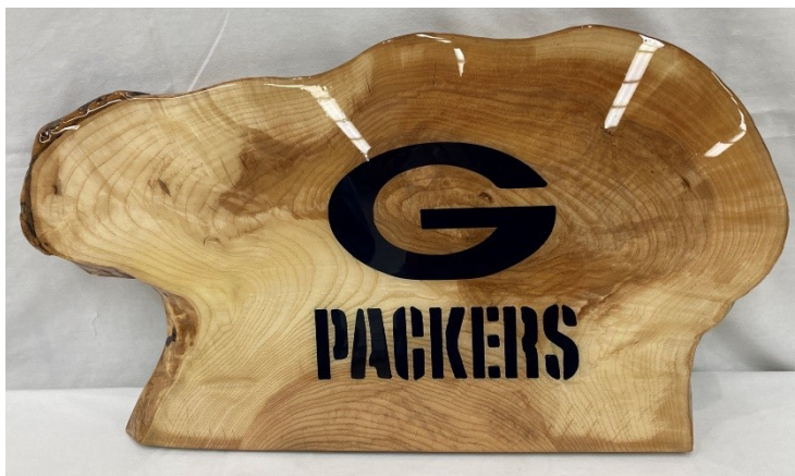
Below: Green Bay Packers Plaque by Dan Riese