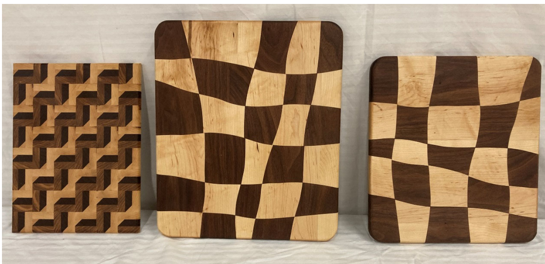
Below : Three 3-D Cutting Boards Jerry Krug