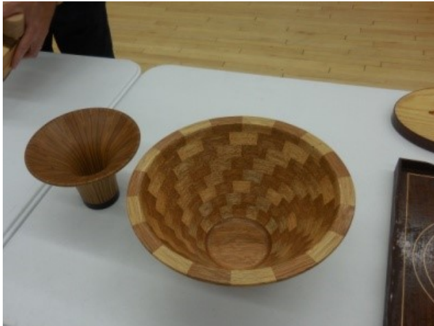
Top Left: Two Segmented Bowels by Dan Webb