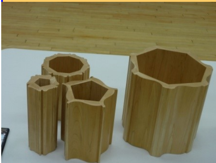
Top Left: Four Vases made from Crown Molding by Reed Craft