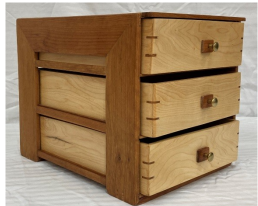
Above: Three Drawer File cabinet by Lynn Barnes