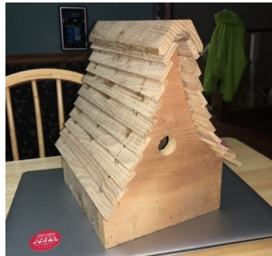
Bottom Right: What a Club Meeting During the Covid 19 Era Looks Like