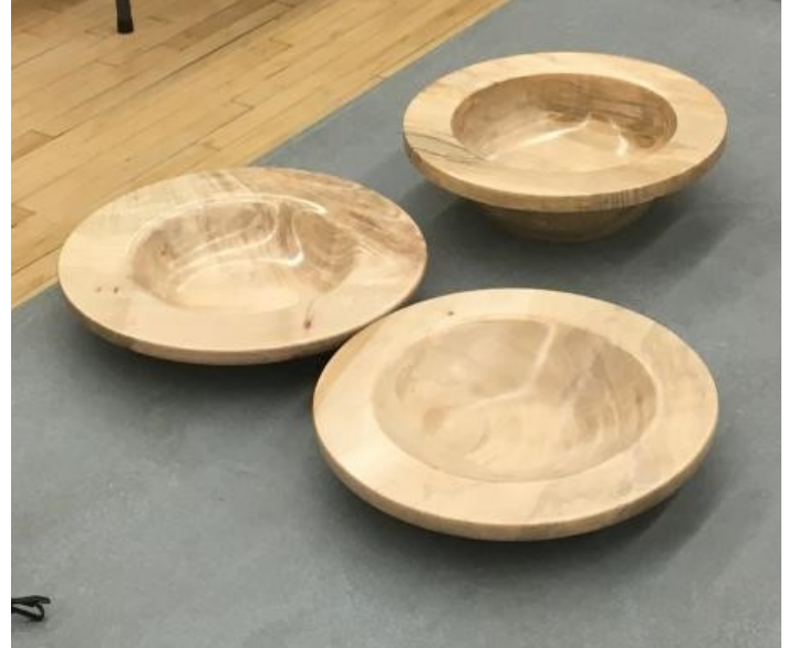
Top Left: Turned bowels with CNC carved lids by Jon Hix