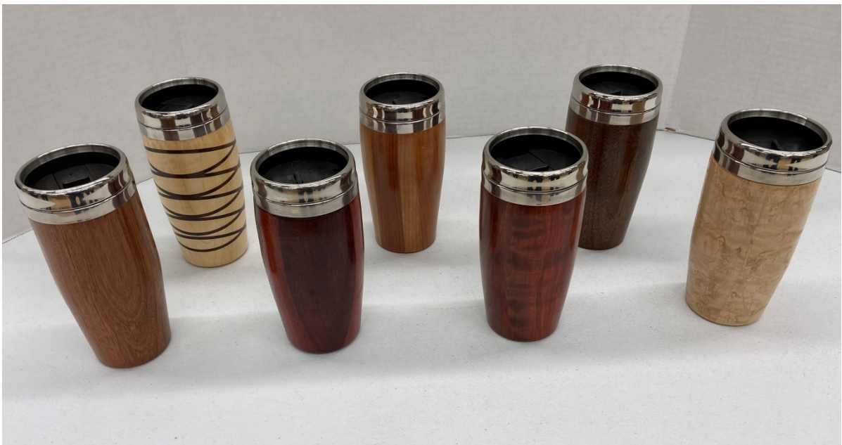
Below Left: Several Thermal Wood Coffee Cups by Jerry Krug