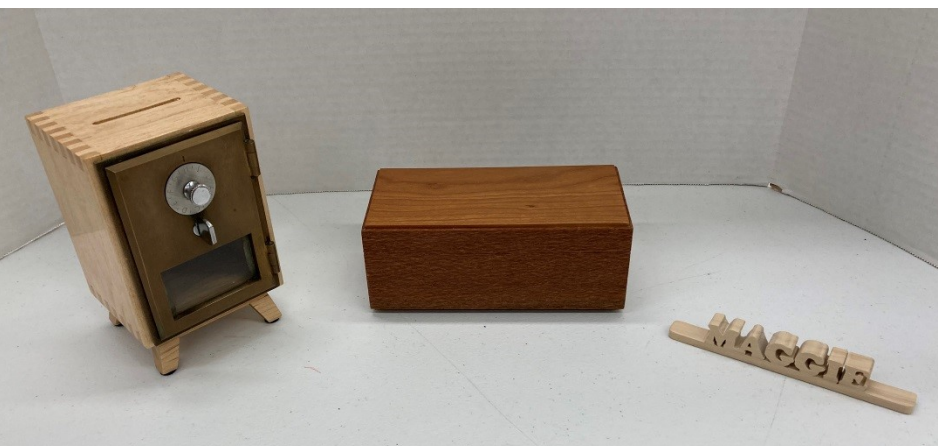
Below Right: Presentation Folio of Completed Projects by Dan Risse.