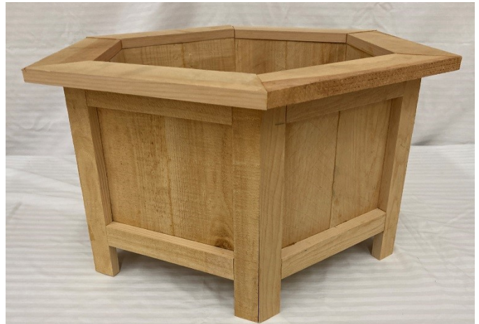
Above: Planter by Barney Barnes Below: Wooden Swiss Army Knife by Rod Lair