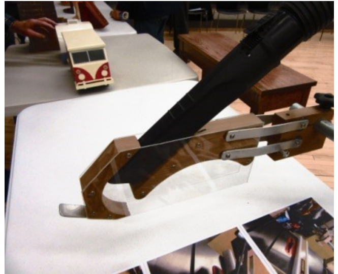
Top Right: Table Saw Over Arm Dust Collection By Stephen Crouse