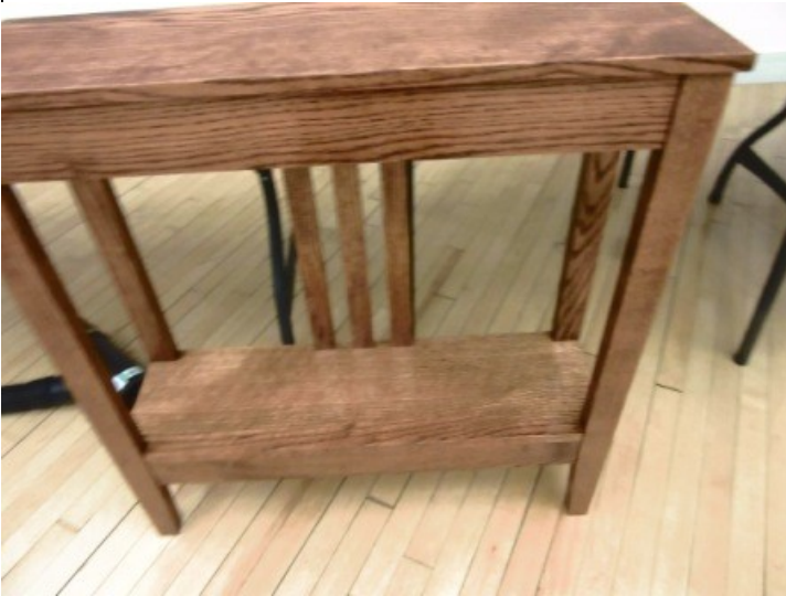
Top Left: Table by Bob Hewlitt