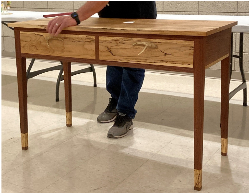
Above: Table by Kevin Gade Furniture winner and Best of Show