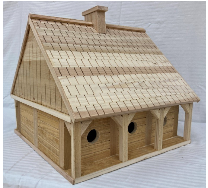
Above: Six Plex Wren Condo by Lynn Barnes