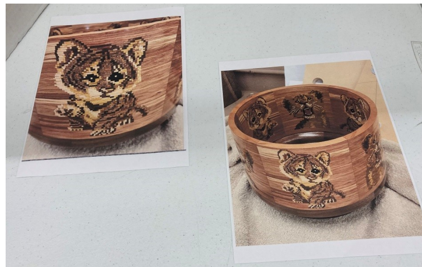
Bottom: Picture of Turned Cat Bowl by Jim Fitkin