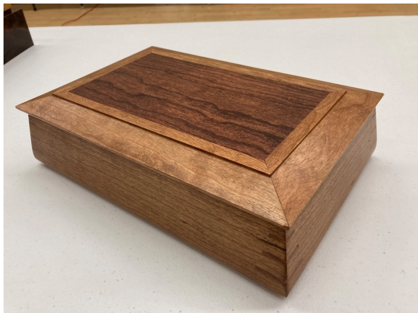
Below: Keepsake Box with Walnut Inlay