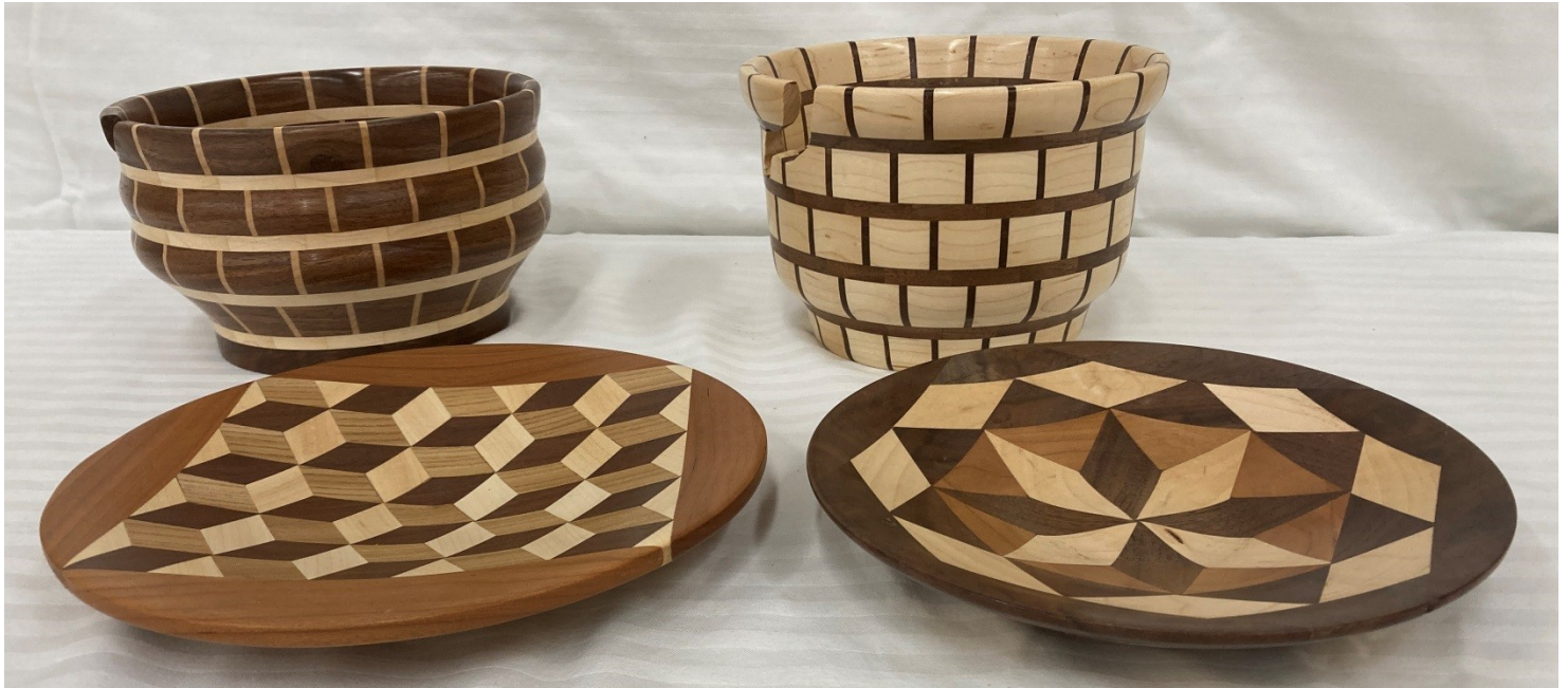
Above: 2 Turned Segmented Yarn bowls & 2 3-D Plates Below: Two Duck Calls by Kevin Gade