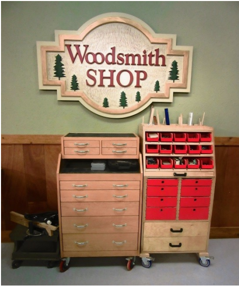
Wood smith Left and Right and Below Left