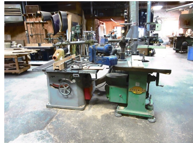
Great Plains Millwork Above Right and Below Left and Right