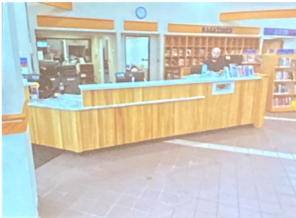
Not Pictured: Rod Lair also Showed a Bench