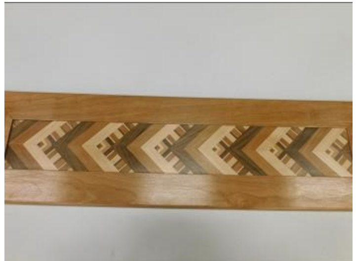
Top Left: CNC carved pool sign by Jon Hix Top Right: Parquet Wall Hanging by Reed Craft Center: Turned Walnut Bowl by Ken Kresser Bottom Left: CNC Carved Eagle by Jon Hix Bottom Right: This months speaker Craig White discussing sustainable building and design.