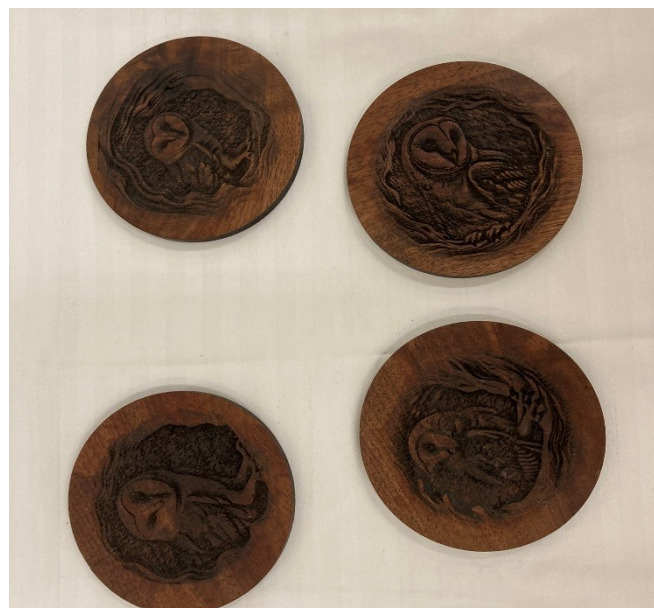
Below: Four Laser Cut Coasters by Jon Hix