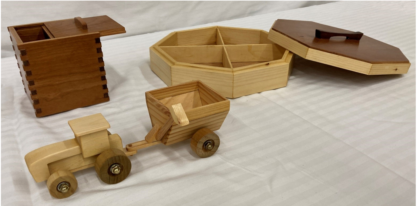
Above: Toy Tractor and wagon plus two Wooden Boxes Rod Lair